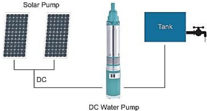
DC Water Pump